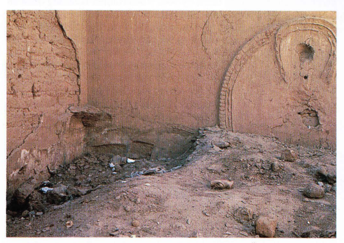
(Fig. 4) Southwest corner of chapel 13, Temple of Yeshe Ö, 1993 Tholing monastery, Tibet Autonomous Region