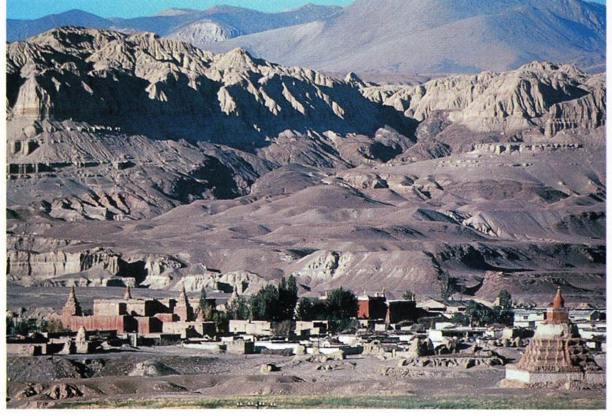
(Fig. 1) The ruins of Tholing monastery Tibet Autonomous Region

older. In many parts of the temple it can be seen that behind the 12th/13th century sculptural fragments, an older layer of painting still exists. As can be seen on the fragment of a painted bodhisattva in Figure 5, which seemed to have been freshly exposed in the year of our visit, this layer belongs to the original building phase and would thus be dateable to the late 10th century. In other cases, however, the older painting seems to be merely decorative, but the few small fragments uncovered at places where sculptures once stood do not give us any reliable clues concerning their subject. However, considering these finds, we can expect that throughout the extensive temple, an older layer of painting is preserved underneath a cover of clay. Whether these murals are mainly decorative or in fact representational, they are certainly the largest group of paintings preserved in the TAR belonging to the original decoration of a temple. Dating to the end of the 10th century, they are probably also the oldest murals extant. Besides the Gyatsa, another nearby ruin also shows traces of 10th century painting below a layer